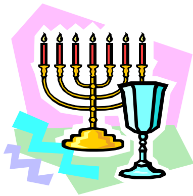
13th - Yom Kippur