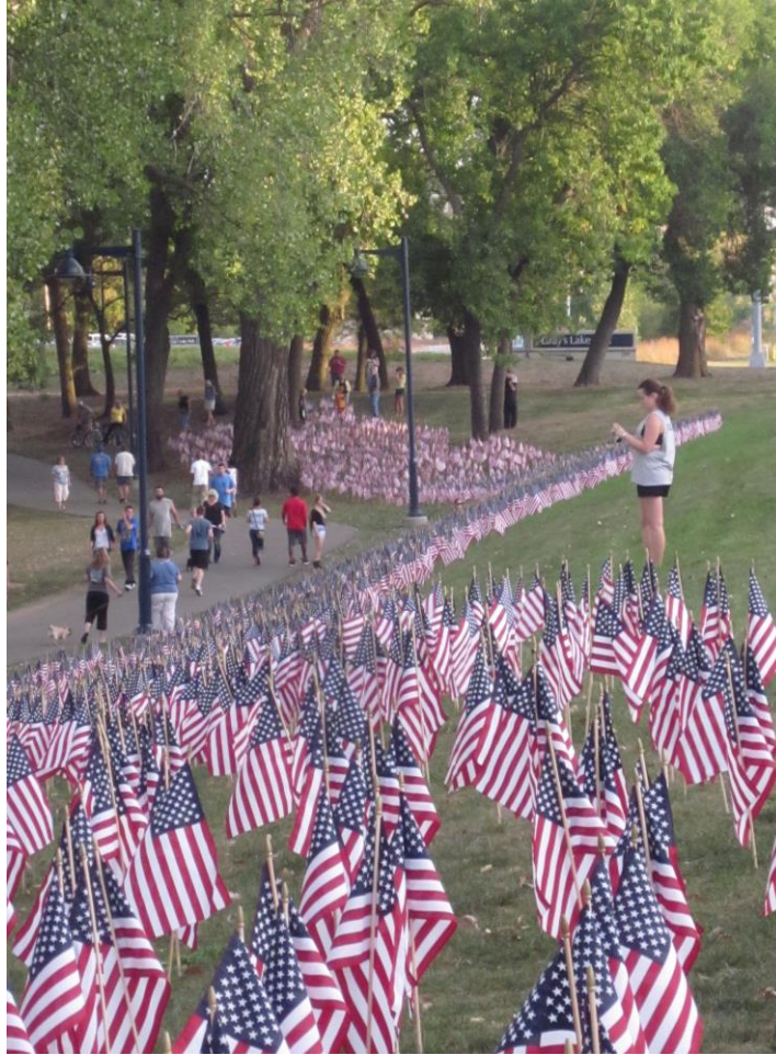
A flag planted for every person that perished on 9.11