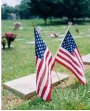
11 th : Veteran's Day