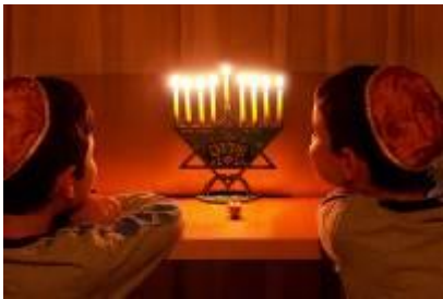
27 th : Happy Hanukkah