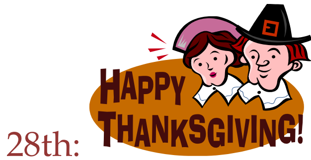
28 th :