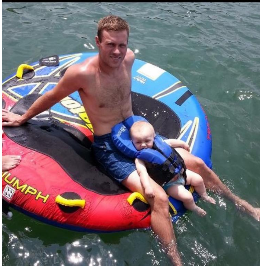
Lake of the Ozarks (The girls were there too, just no pics of them)