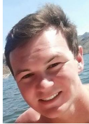
21 st – Austin turns 22