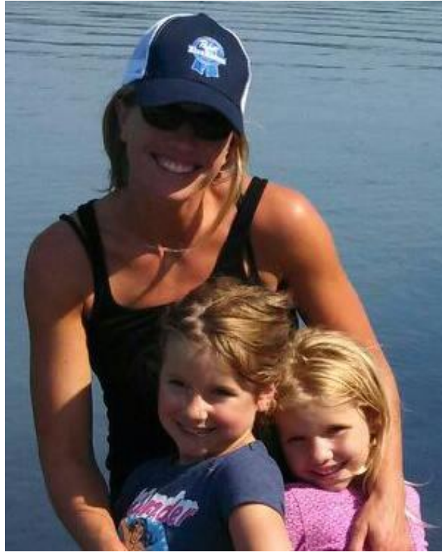
PICKERINGS: Rogue River 2015